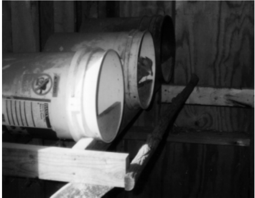
Nests made from 5-gallon buckets with a roost pole in front

Another thing I had given some thought to was how I would make the nest boxes. The answer came when I read somewhere that ordinary 5-gallon plastic buckets could be used for the nests. I cut a couple of support boards to cradle three of the containers in one corner of the chicken house. After tracing the shape needed, I cut three crescents from scrap 1 x 4 stock and nailed them into the opening of the